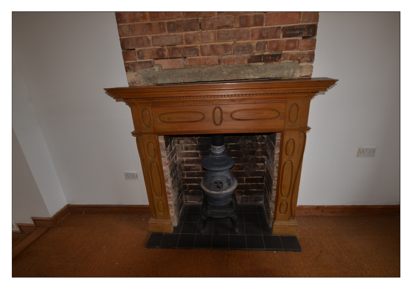
Capitol Lettors has not tested any of the equipment or the heating system (if mentioned) in these details. Purchasers are advised to satisfy themselves as to their working order and condition. These particulars do not constitute or form any part of an offer or contract nor may they be regarded as representations. All interested parties must themselves verify their accuracy. All measurements are approximate.