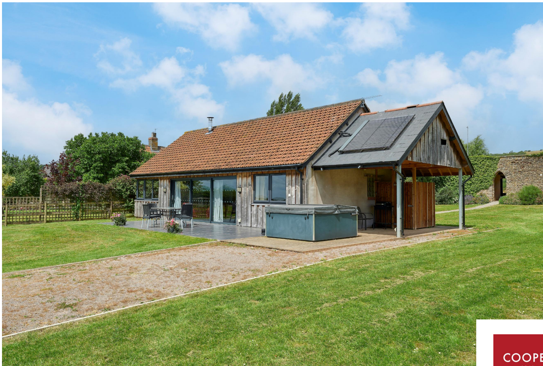
The Walled Garden Cottage, Bleadon, BS24 0NY