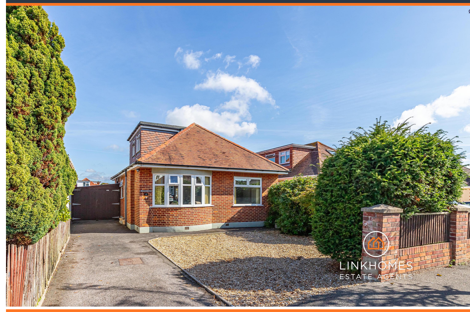
23 Cheddington Road, Bournemouth, Dorset, BH9 3NB Guide Price £450,000

** BOASTING OVER 1,200 SQUARE FEET OF LIVING ACCOMMODATION ** Link Homes Estate Agents are delighted to present for sale this 3/4 bedroom detached chalet bungalow situated in the BH8 postcode. Benefitting from an array of fine features including three generously-sized bedrooms with built-in storage, a separate living room with a feature electric fireplace, a dining room leading onto the bright and airy conservatory, a four-piece family bathroom suite on the ground floor and a three-piece bathroom suite on the first floor, ample storage throughout, a well-presented garden with a hot tub, a garage and off-road parking for multiple vehicles. This is a must-view to appreciate the living accommodation and the wealth of space on offer!