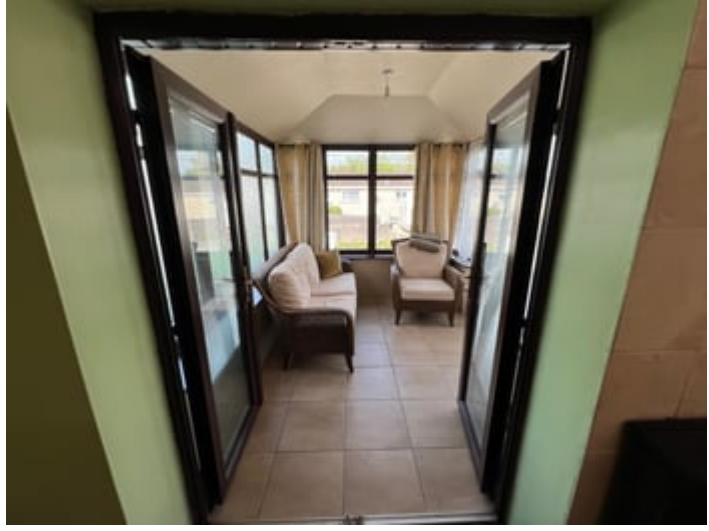
10' 0" x 8' 7" ( 3.05m \times 2.62m ) with dwarf walls and uPVC units, patio doors to side looking out onto the garden with distant views over open countryside.