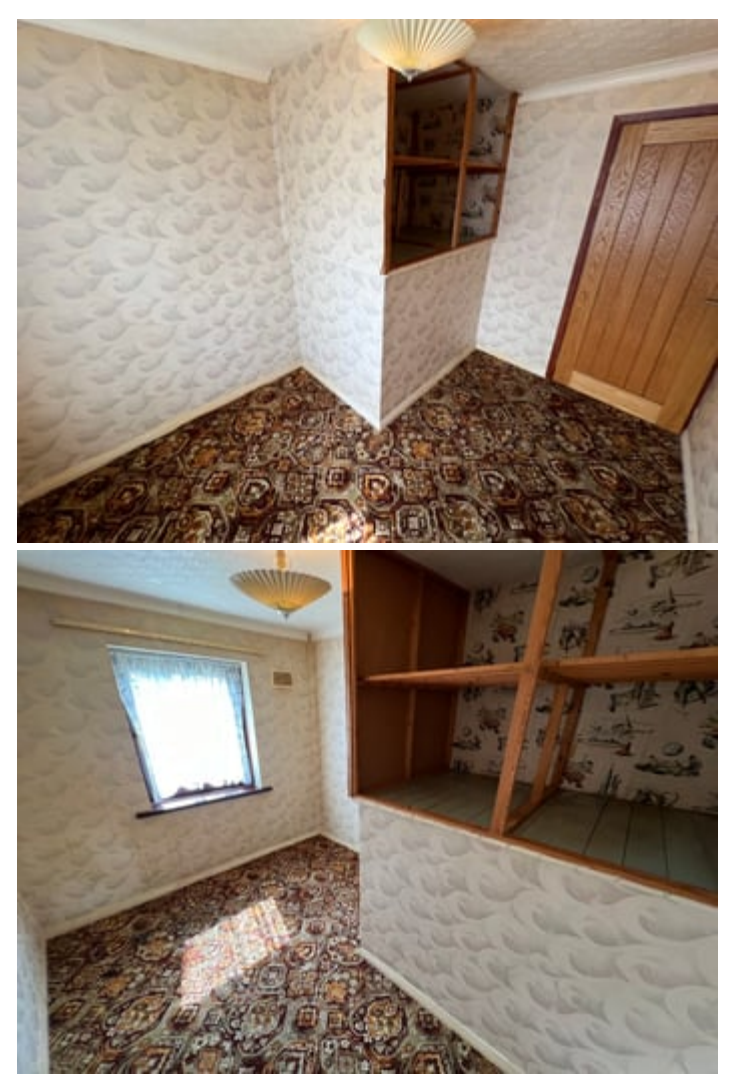
10' 4" x 8' 3" (3.15m x 2.51m) with double glazed window to front, storage cupboard.