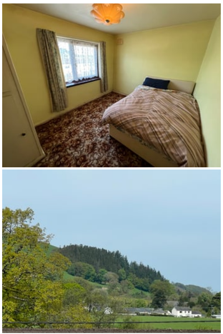
8' 8" x 11' 8" (2.64m x 3.56m) with double glazed window to rear with views over the distant countryside, door into cupboard housing a hot water tank.