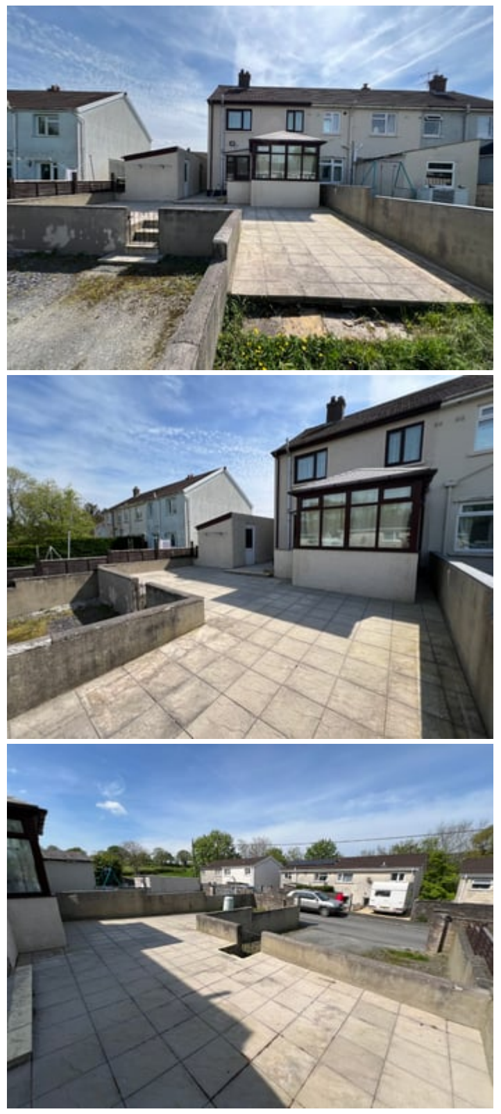
Is a low maintenance garden mostly laid to slabs with a small lawned area to rear, steps leading down to a gravelled parking area with private parking for 2 cars.