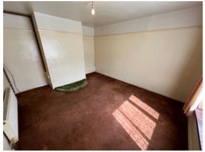
12' 0" x 14' 0" (3.66m x 4.27m) with double glazed window to front, central heating radiator, chimney breast with tiled hearth, picture rail.