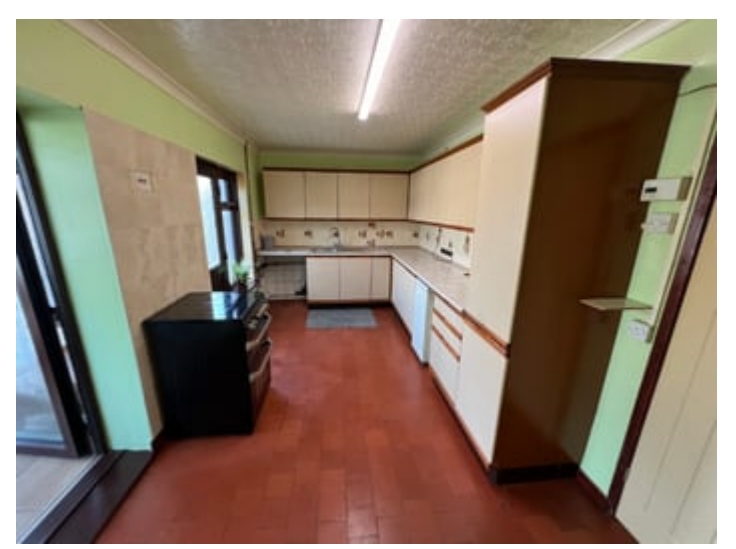
18' 2" x 8' 8" (5.54m x 2.64m) with a range of fitted base and wall cupboard units with Formica working surfaces above. Stainless steel single drainer sink, electric oven and hob, oil fired Eurostar boiler, plumbing for automatic washing machine, red tiled flooring, half glazed uPVC external door, central heating radiator, glazed patio door into -