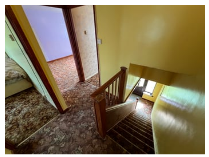
6' 3" x 6' 0" (1.91m x 1.83m) with access to loft.