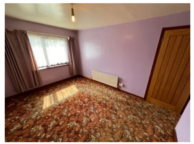
9' 8" x 14' 0" (2.95m x 4.27m) with double glazed window to front, central heating radiator.