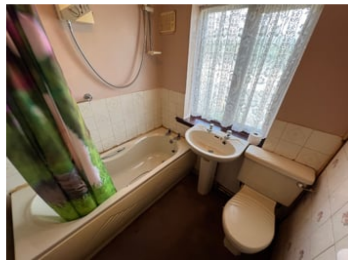
6' 0" x 5' 7" (1.83m x 1.70m) a 3 piece suite comprising of panelled bath with hot and cold taps above, Heatstore electric shower above, pedestal wash-hand basin, low level flush WC, frosted window to rear, half tiled walls, central heating radiator.