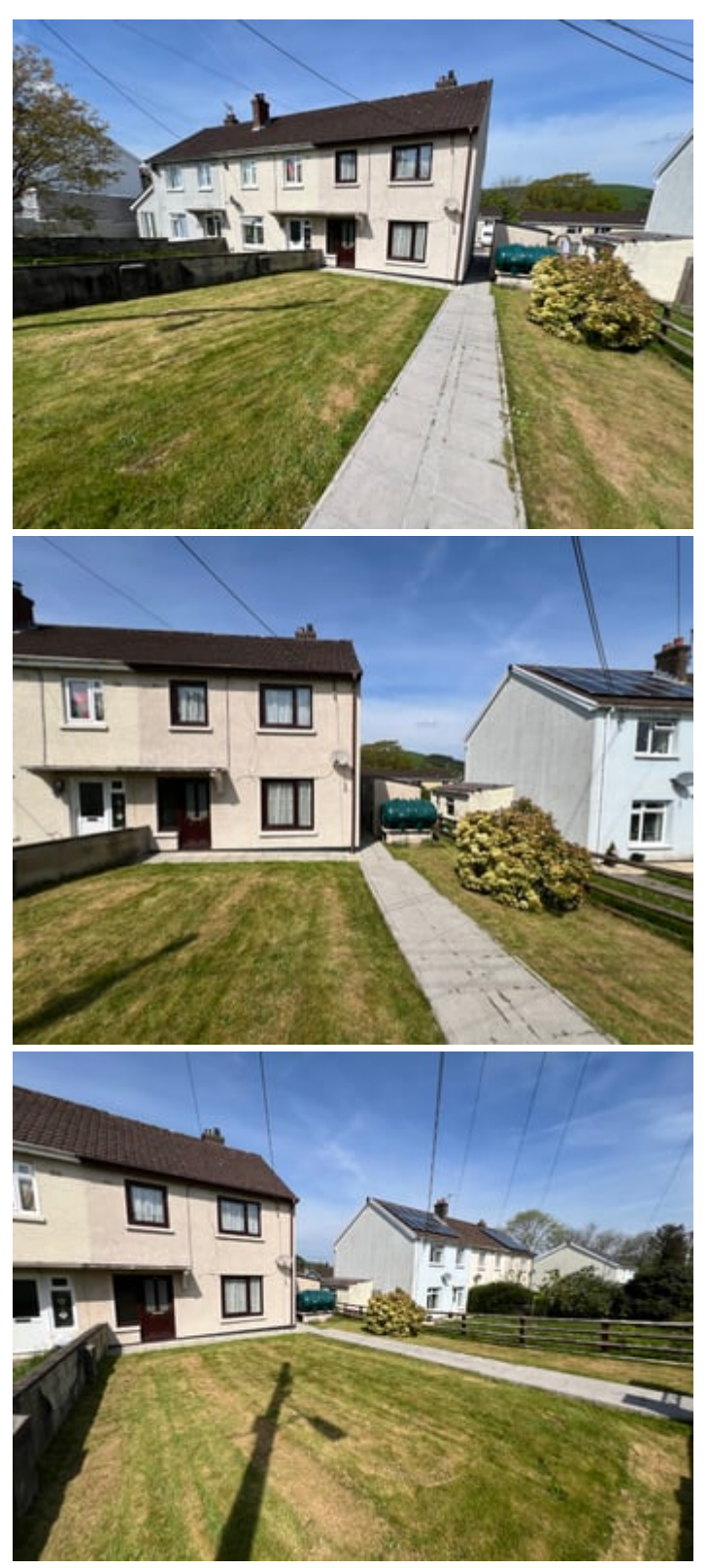
A spacious lawn area with a pathway leading down, all laid to slabs leading to the front door and side.