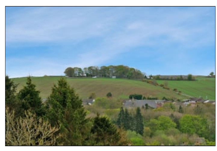
COUNCIL TAX BAND - C EPC BANDING - B