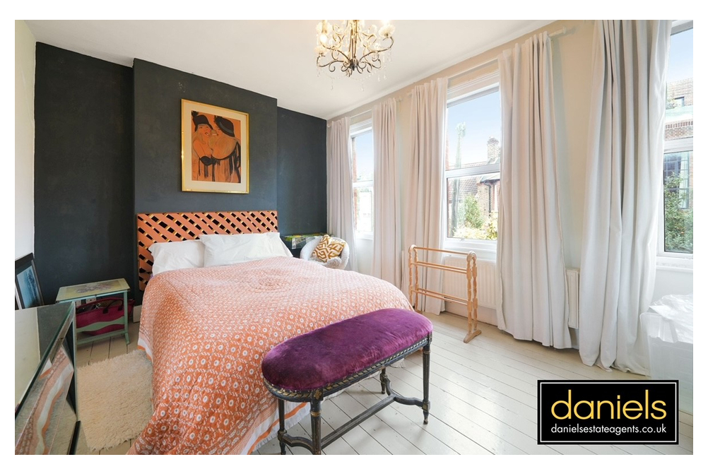
Pember Road, Kensal Green, London NW10 5LN £1,200,000 - Freehold