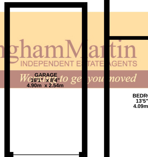
TOTAL FLOOR AREA : 806 sq.ft. (74.9 sq.m.) approx. Made with Metropix ©2024