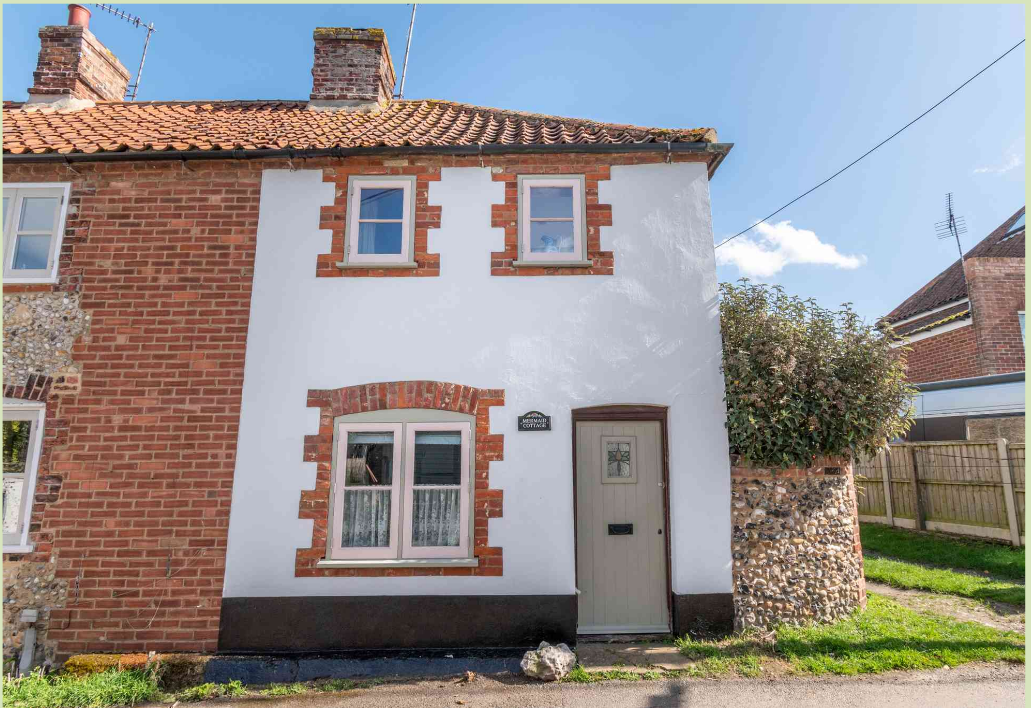
Mermaid Cottage, Wells-next-the-Sea Offers in Excess of £300,000