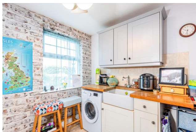
KITCHEN & UTILITY ROOM

FIRST FLOOR LANDING Double glazed window, doors to bedrooms and bathroom.