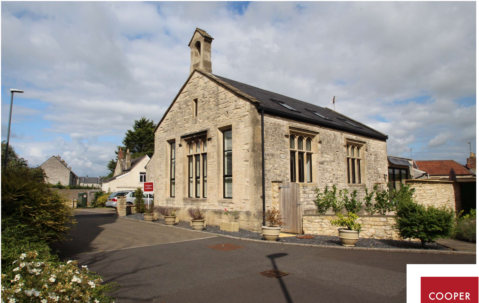
Westbrook House, 1 Trinity Close, Paulton BS39 7LA