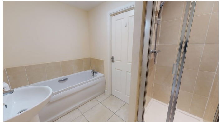
Bedroom with En Suite