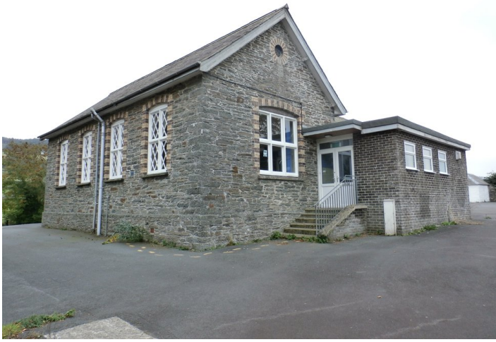
YR HEN YSGOL, LLANAFAN - INTERNAL