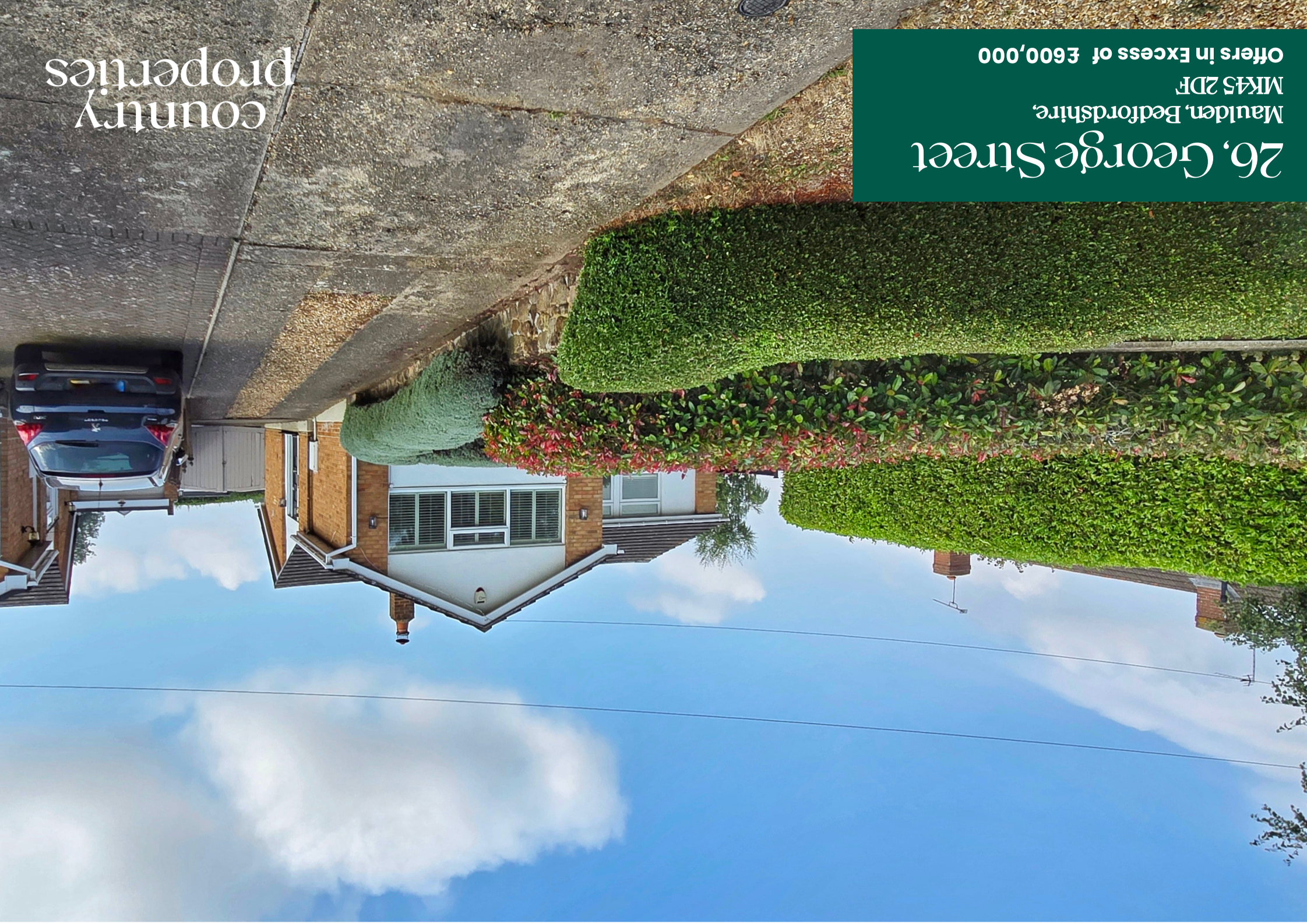
GARAGE 279 sq.ft. (25.9 sq.m.) approx.