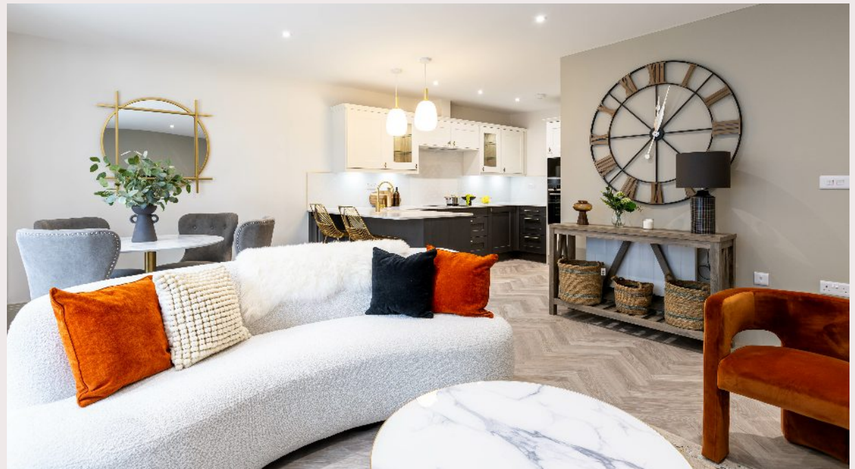
Examples of furnished apartment