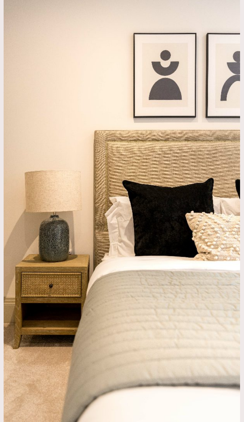
Examples of furnished apartment