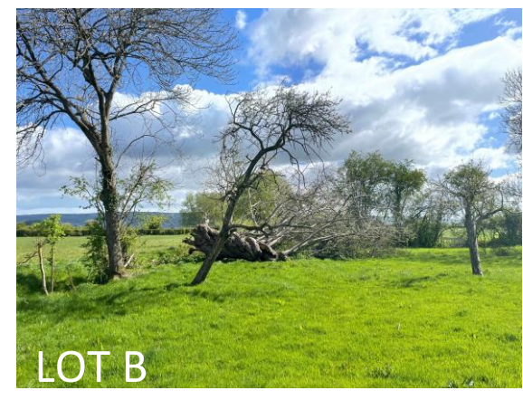
Auction Guide Price: OFFERED FOR SALE IN TWO LOTS

Tuesday 18<sup>th</sup> June 2024, 12 midday The Theatre, The Royal Bath and West Showground, Shepton Mallet, BA4 6QN Bid remotely via Livestream, in person or by proxy.