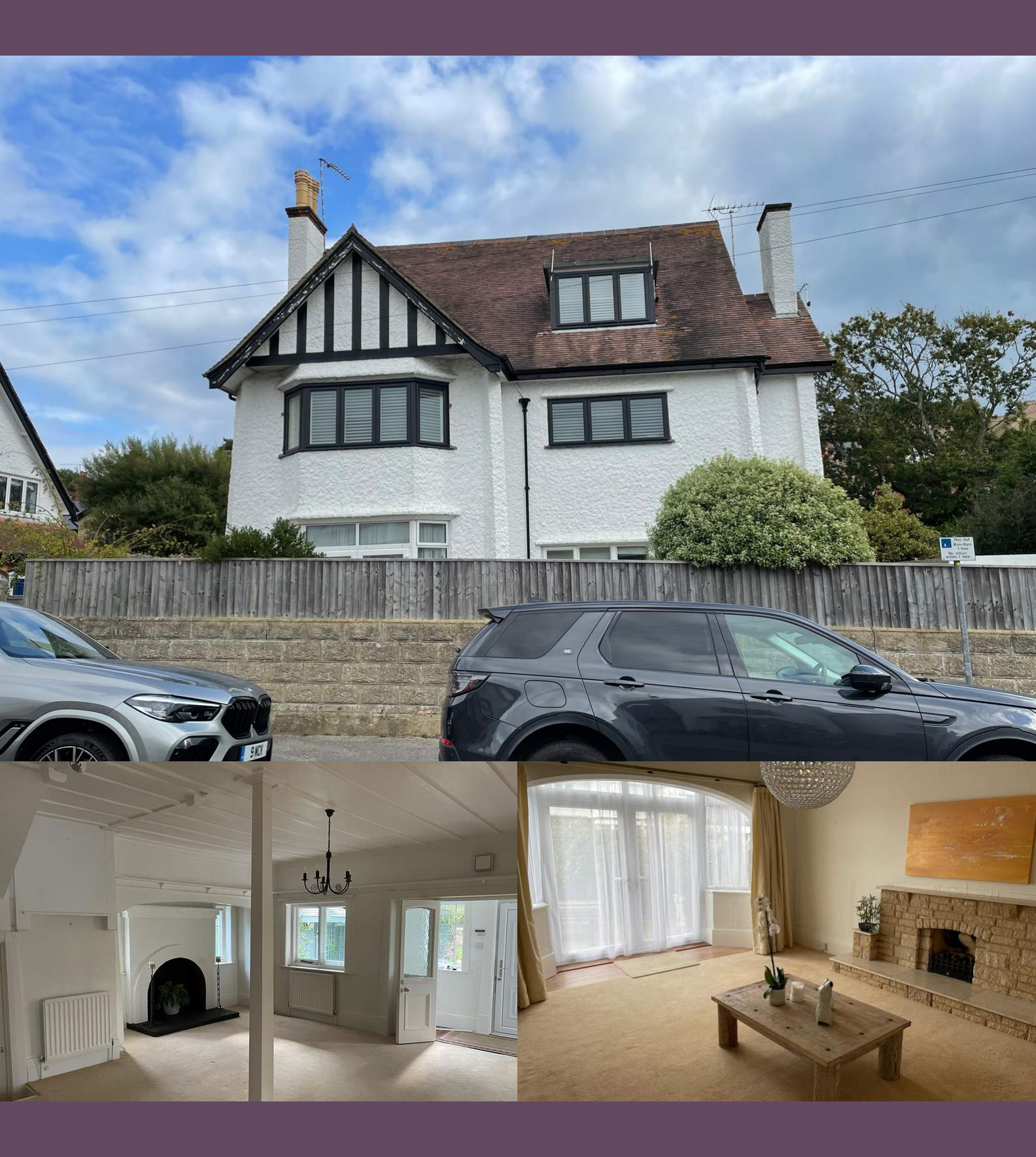
FLAT 2, 6 MAXWELL ROAD, POOLE, DORSET, BH13 7JB

SALES, LETTING & SEARCH AGENT TRANSPARENT. BESPOKE. EFFECTIVE