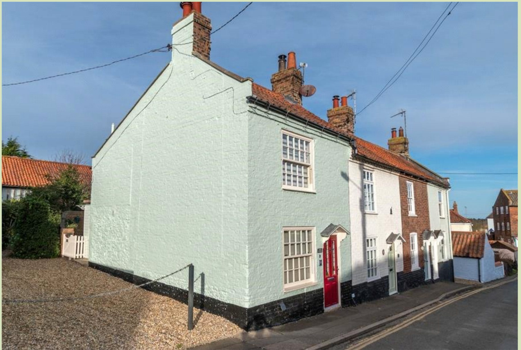
Arnica Cottage, Wells-next-the-Sea Offers in Excess of £450,000