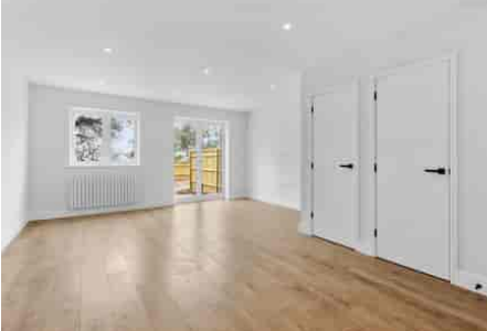
Plot 3 (No 4), Bradshaw Close, Guestling, East Sussex TN35 4LW £385,000 freehold

Call us now on 01424 774774 to view this beautifully designed brand new three bedroom mid terrace home (circa 115m2) boasting an exceptional specification and set in this exclusive development enjoying spectacular rural views built by Prestige Homes and sold with a 10 year Protek warranty. Call n