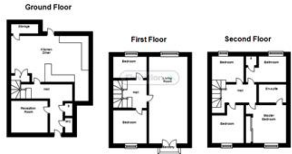
Floor plans are for layout purposes only. Measurements are approximate and subject to measurements. Plan produced using PlanUp.