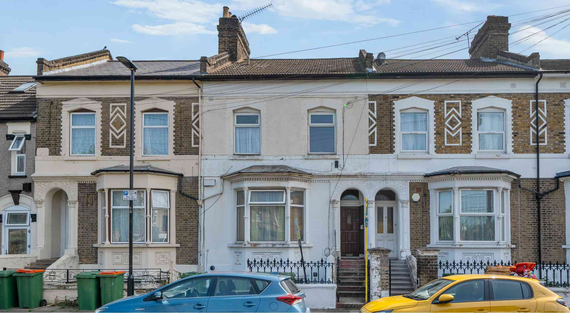
St Antonys Road, Newham, E7 9QB