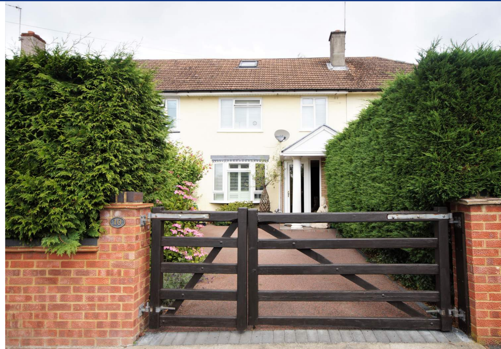
Holberton Road, Reading, Berkshire. RG2 8NL.