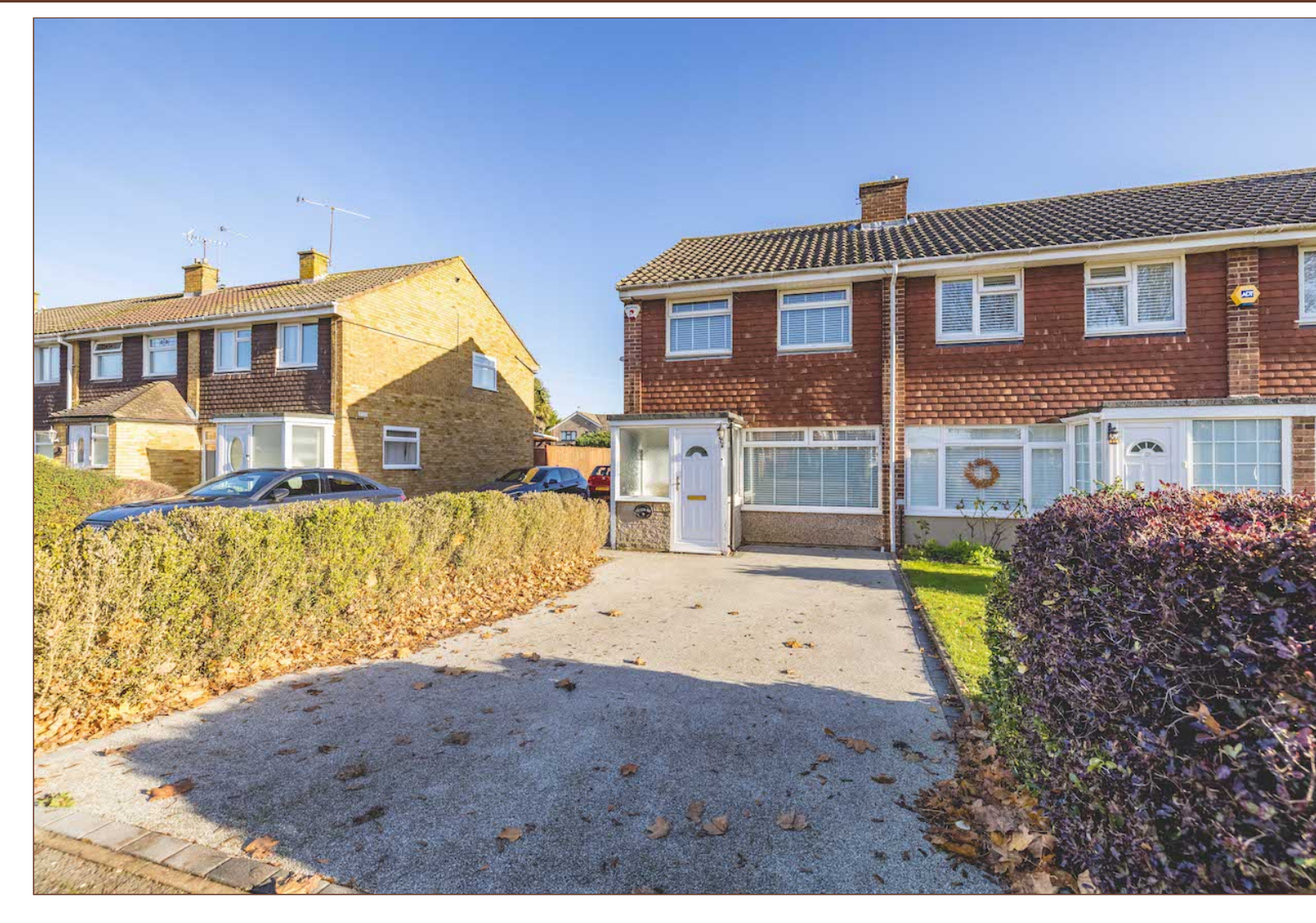
Situated a short walk from multiple local schools this three bedroom family home is nestled towards the end of a quiet cul-de-sac only half a mile from Langley station.

The property comprises a porch entrance leading to 14ft living room, downstairs cloakroom, and a large open plan 20ft modern kitchen with separate dining area. The kitchen consists of an excellent range of high-gloss storage units complemented by granite worktops, gas cooker, breakfast bar, and French doors overlooking the rear garden.