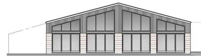
PROPOSED NORTH ELEVATION Scale 1:100