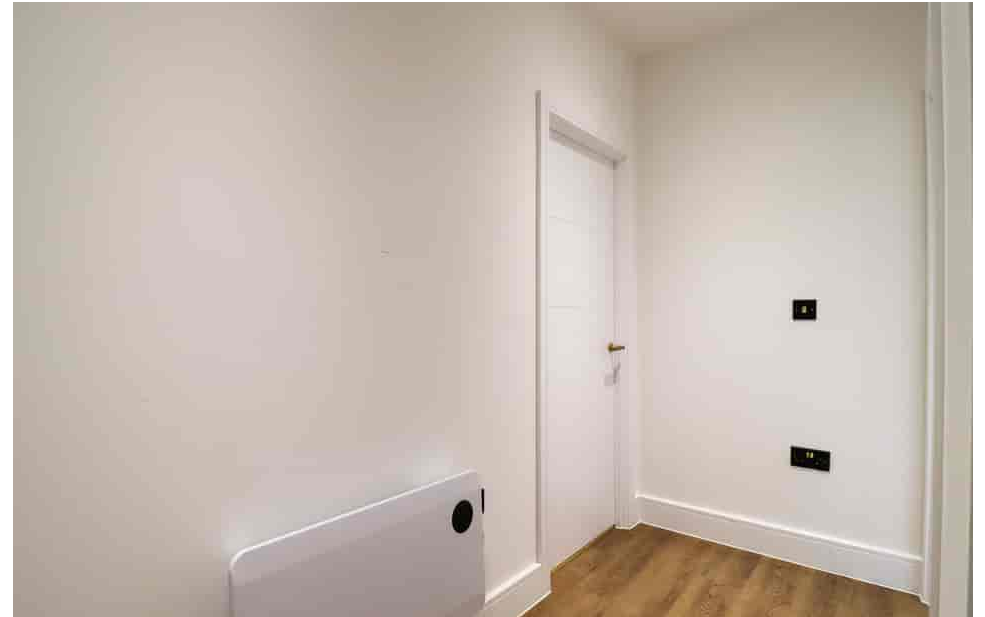
Dunster Street, Northampton NN1 3DQ £1,050 pcm