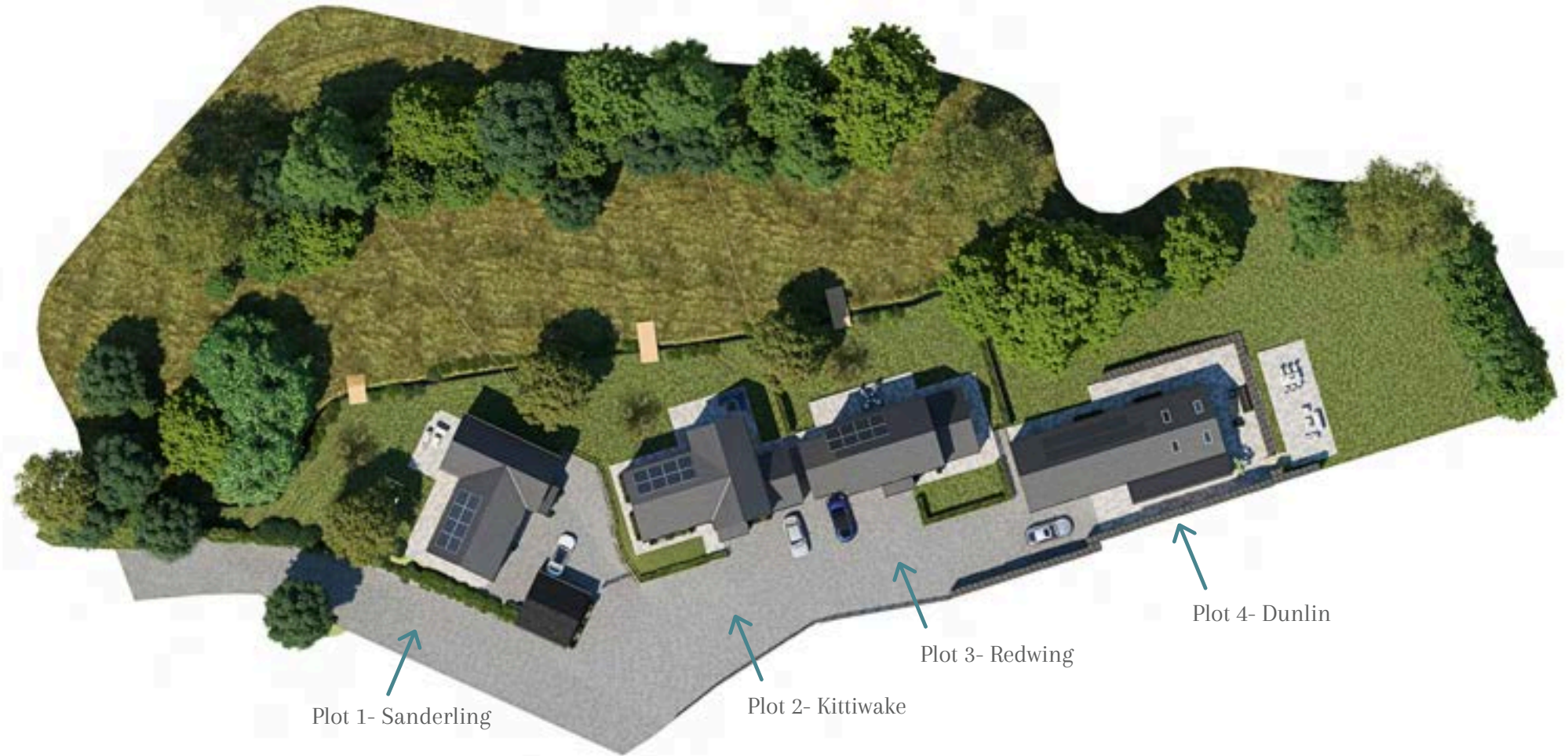
Plot 1- Sanderling