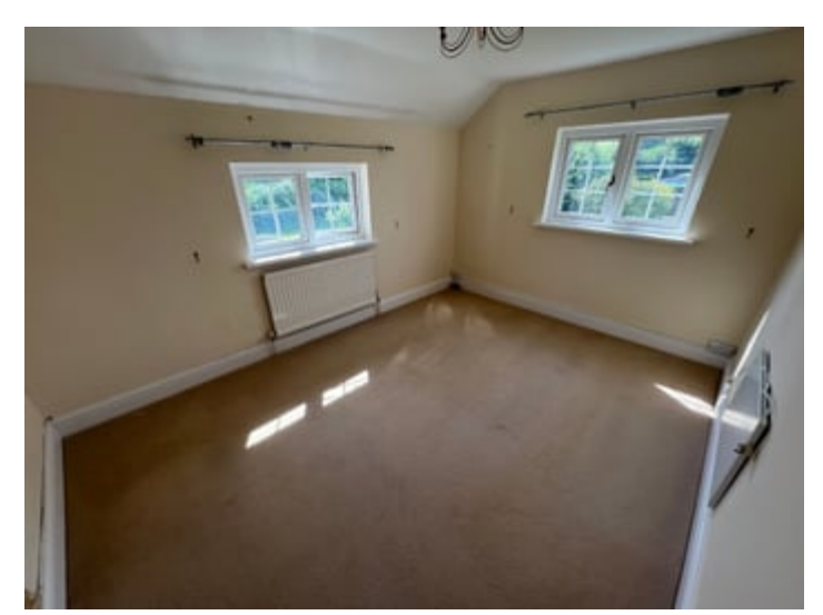
9' 7" x 12' 9" (2.92m x 3.89m) with dual aspect window to front and side, central heating radiator. Door into -