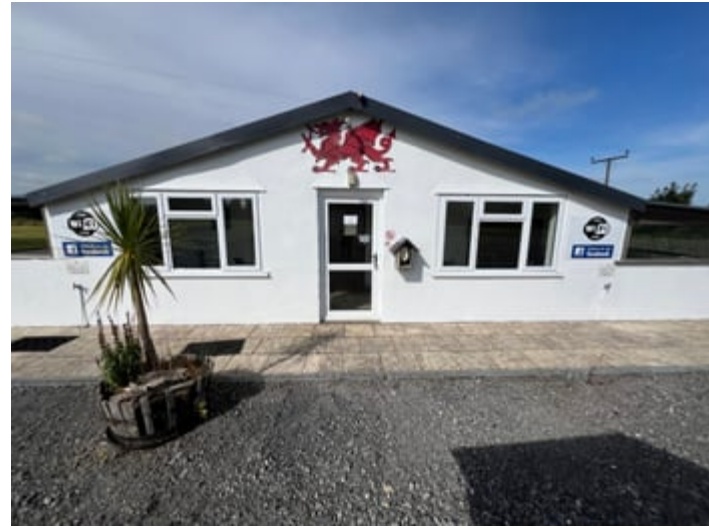
Washing up Station

10' 5" x 5' 8" (3.17m x 1.73m) with 2 stainless steel sinks.