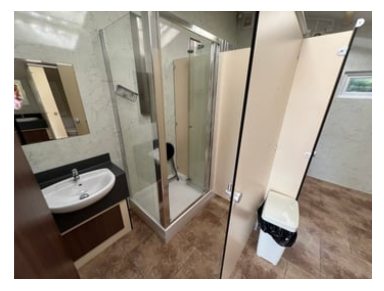
Male Shower Block /Toilet Block