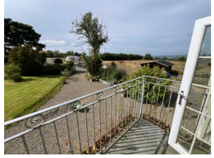
14' 0" x 23' 7" (4.27m x 7.19m) a spacious room on split level with patio doors opening out to a wonderful balcony of galvanised steel making the most of the breathtaking panoramic countryside views, double glazed window to rear, central heating radiator, wall lights. Door into -