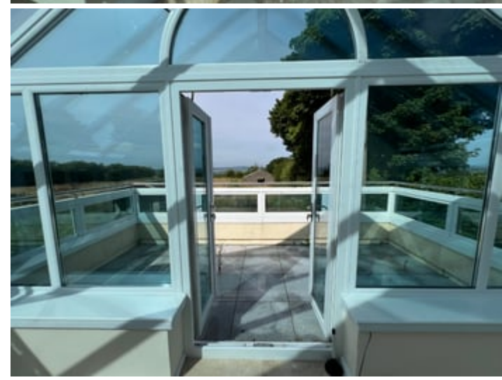
15' 4" x 7' 2" (4.67m x 2.18m) with bifold construction with upvc double glazed units surround with Blue self cleaning glass roof, under floor heating, panoramic views over open countryside, apex window, patio doors leading out to -