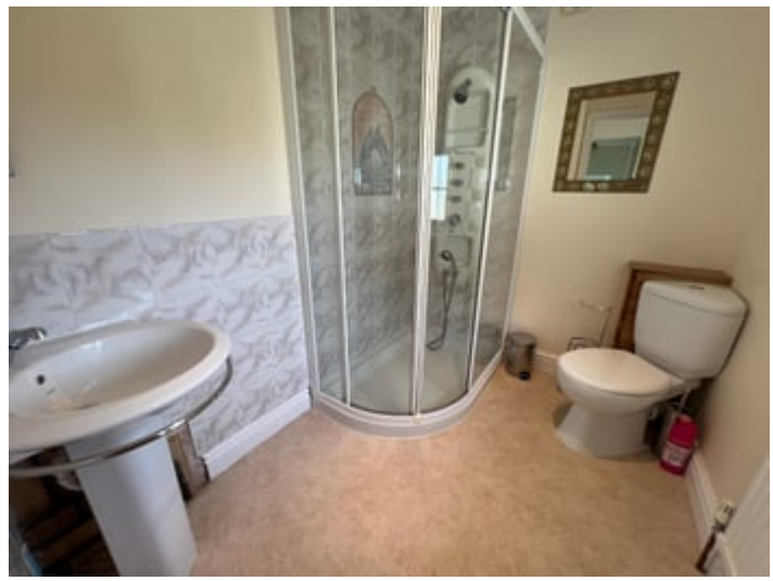
5' 8" x 8' 2" (1.73m x 2.49m) a 3 piece suite comprising of a corner shower unit with mains shower above, pedestal wash hand basin, corner w.c. frosted window to side, central heating radiator, part tiled walls, extractor fan.