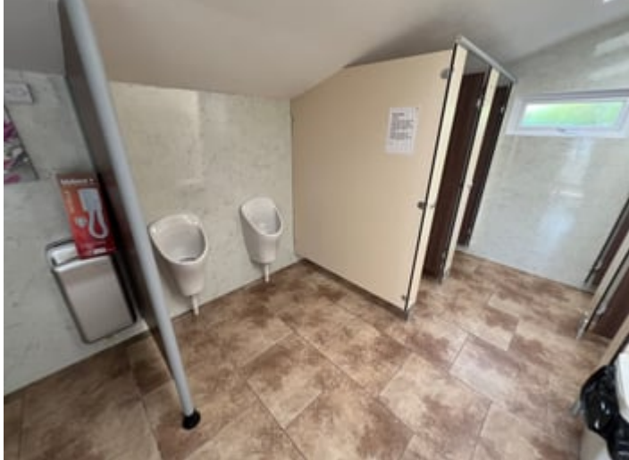
16' 6" x 13' 7" (5.03m x 4.14m) a modern block with pvc lined walls, 3 shower cubicles, 1 disabled, 2 w.c's 2 urinals, 3 wash hand basin, electric hand dryer.