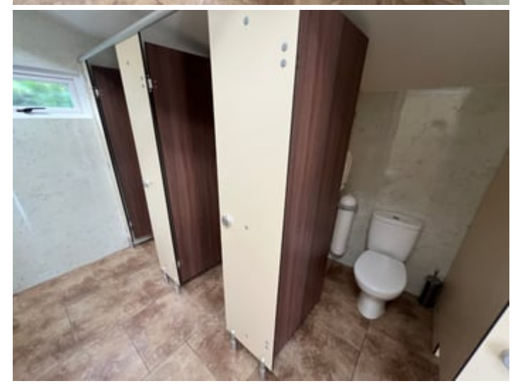
16' 6" x 13' 8" (5.03m x 4.17m) with 3 shower cubicles, 1 disabled accessible. 3 w.c.'s pvc lined walls, tiled flooring, 3 wash hand basins, electric hand dryers and electric hair dryers.