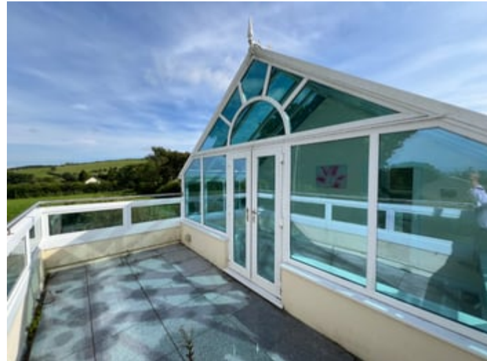
15' 5" x 7' 2" (4.70m x 2.18m) with glass balustrades, tiled flooring, again with lovely country views.