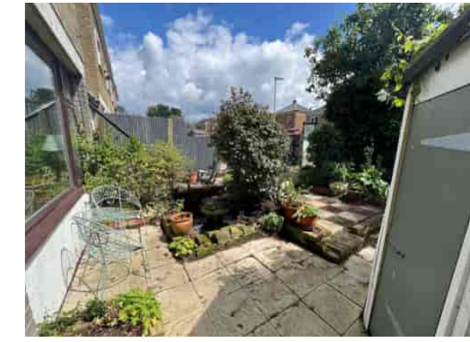
Selby Court, Huntingdon PE29 1HP