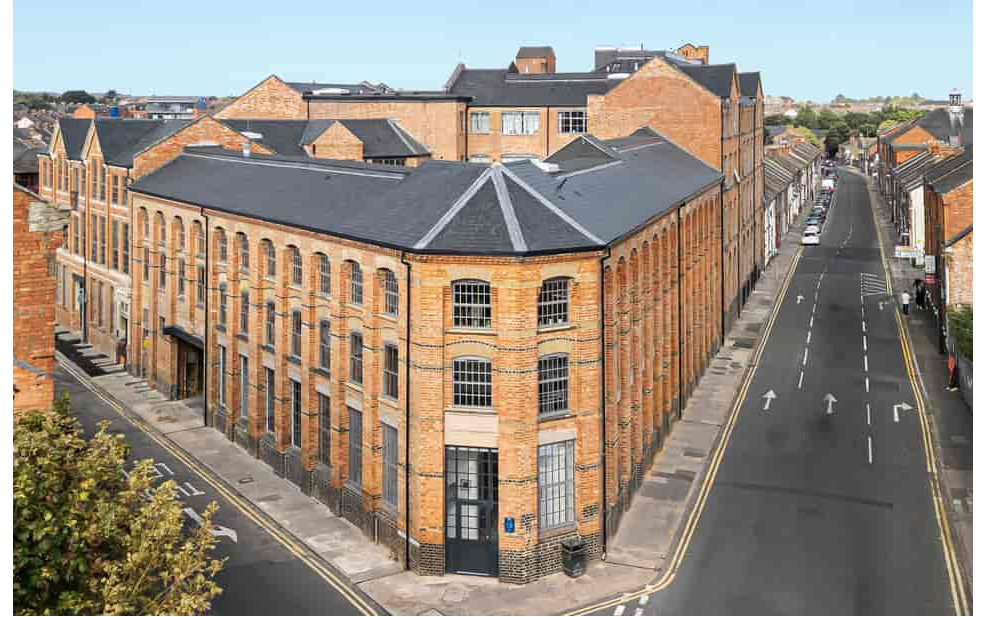
Dunster Street, Northampton NN1 3DQ £1,050 pcm