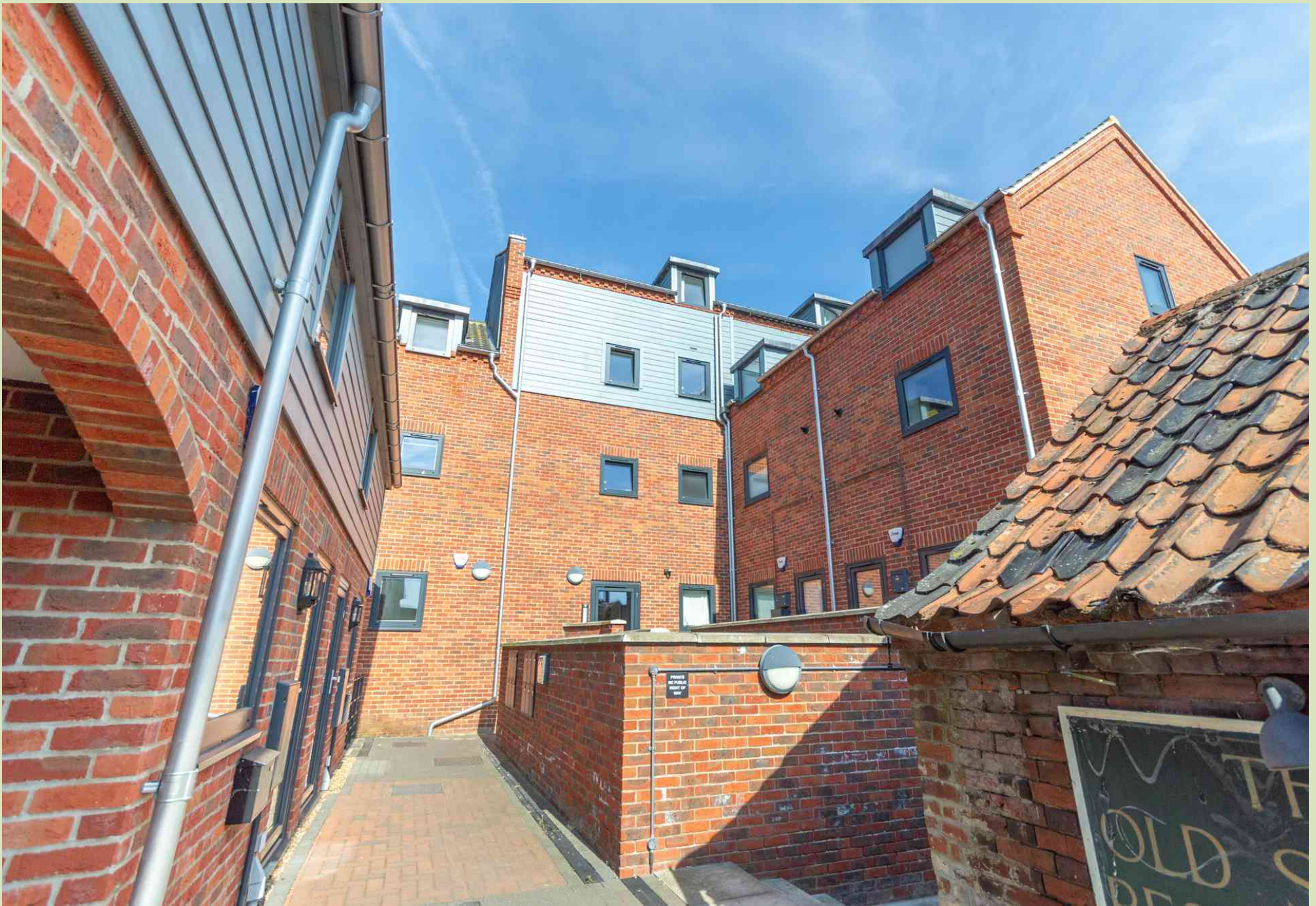
Flat 3, 7 Newmans Court, Fakenham Guide Price £130,000