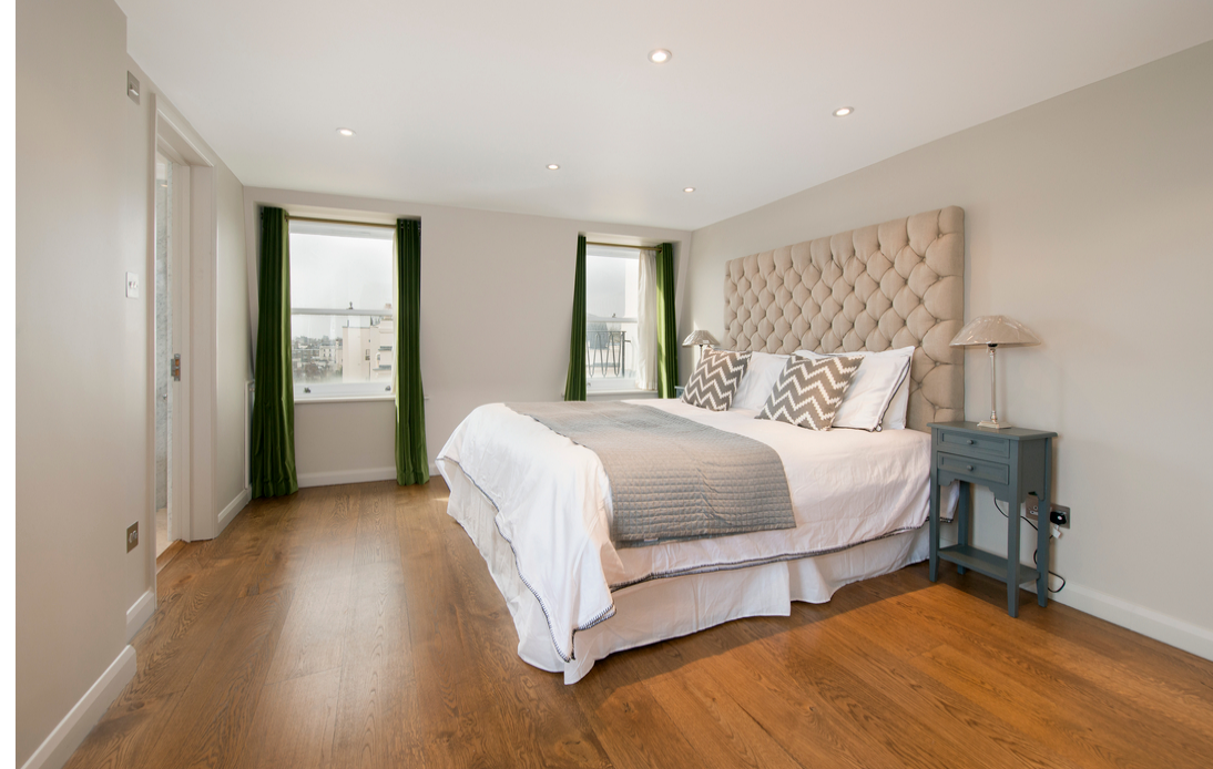
Flat 6, 22 Eaton Square, Belgravia, London, SW1W 9DE £900,000 - Leasehold