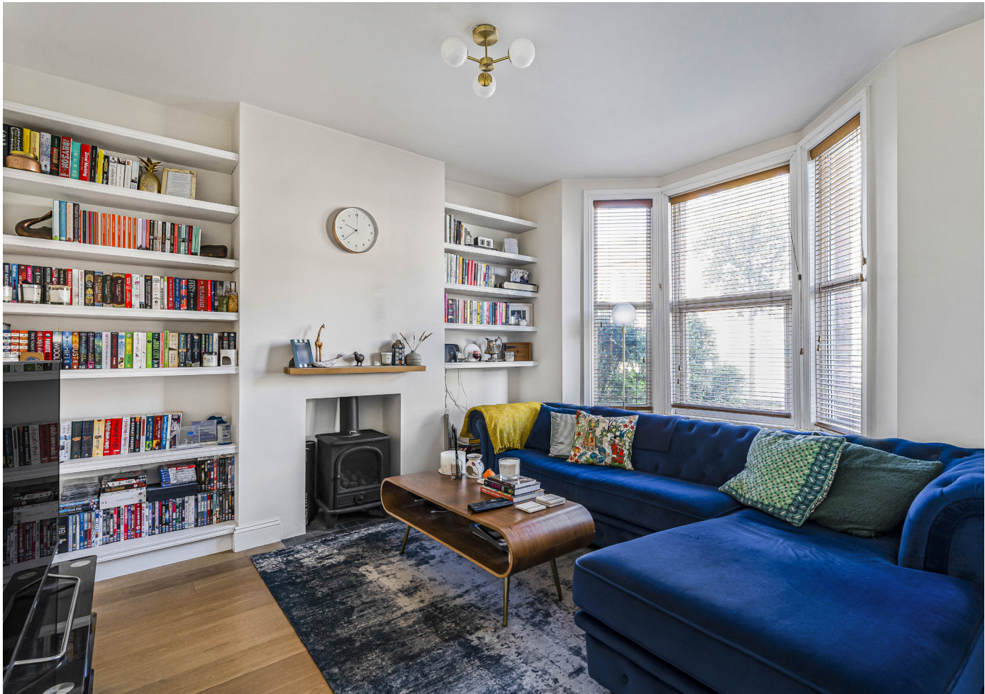
4 BEDROOM HOUSE