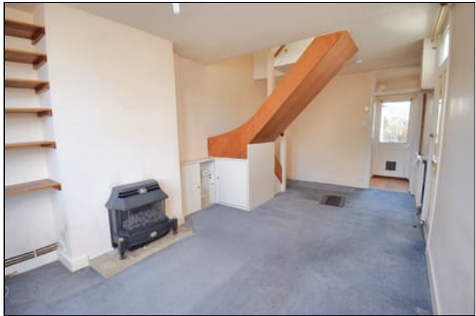
20' 9" x 10' 4" (6.32m x 3.15m) Solid wood front door with borrowed

From Sevenoaks High Street proceed in a northerly direction, at the traffic lights go straight over, bear right into Seal Hollow Road and follow the road down to the next set of traffic lights, bear right and continue into the village of Seal. After passing the recreation ground on your left take the next turning on your left into School Lane and bear first right and carry straight on over two give ways. Proceed past Seal Church which is on your left and follow the country road. Keeping on this road you eventually come into the hamlet of Noahs Ark and the property can be found on the left hand side.