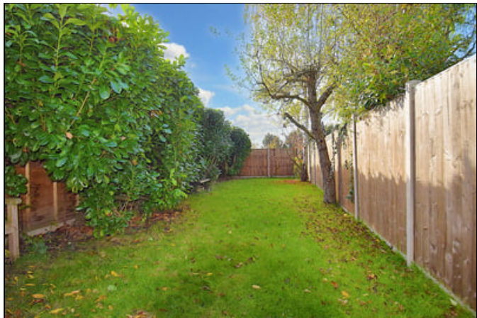
Approximately 60ft long, mainly laid to lawn, timber shed, coal store.