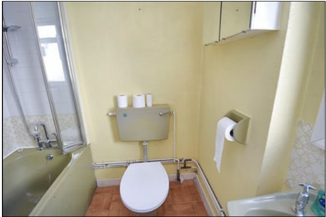
5' 10" x 5' 5" (1.78m x 1.65m) Avocado suite comprising panelled bath with mixer tap and shower attachment, low level W.C., pedestal wash hand basin, opaque window to side, part tiled walls, tiled floor.

Cupboard, shelf beneath side window, door to bathroom.