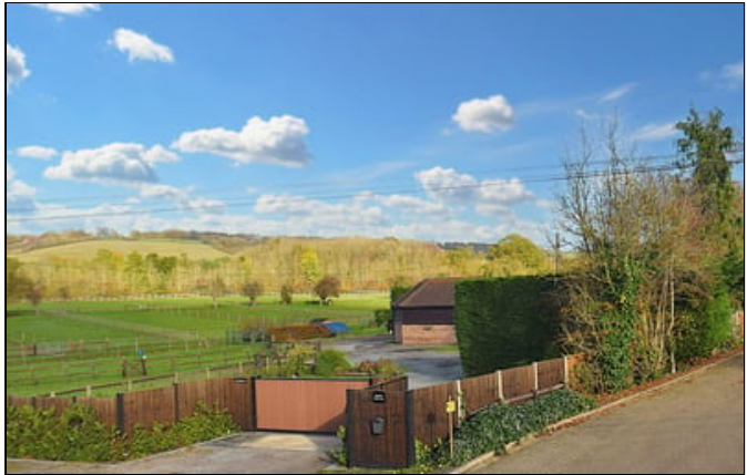
10' 5" x 9' 4" (3.17m x 2.84m) Sash window to front, radiator, cupboard housing hot water tank, lovely views