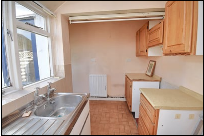
10' 3" x 8' 8" (3.12m x 2.64m) Wood fronted wall and base units, work tops, electric cooker point, space for fridge freezer, stainless steel single drainer sink unit with cupboards beneath, space and plumbing for washing machine, part tiled walls, tiled floor, window to side, open to lobby.

light window above, angled bay sash window to front, two radiators, gas fire with Gloworm back boiler, cupboard housing heating programmer, understairs storage cupboard, cupboard housing fuse box and electric meter, turning staircase to first floor, glazed door to kitchen.