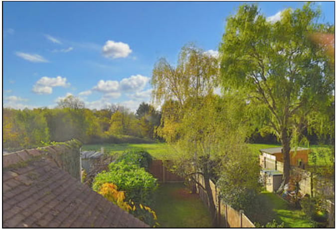
10' 5" x 8' 11" (3.17m x 2.72m) Sash window to rear, radiator, lovely views.