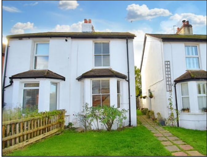
Mainly laid to lawn.