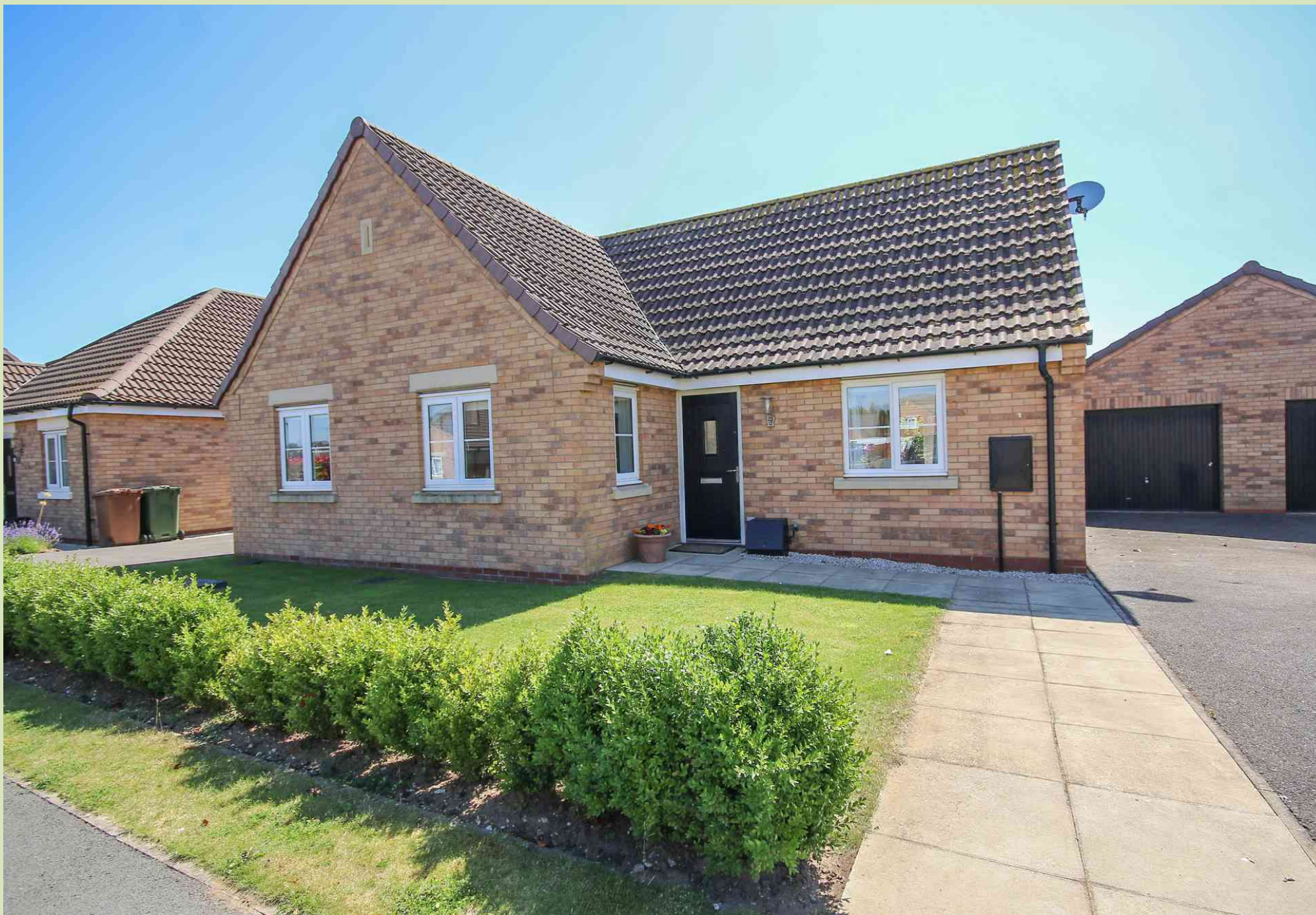
5 Poachers Way, Terrington St Clement Guide Price £299,950