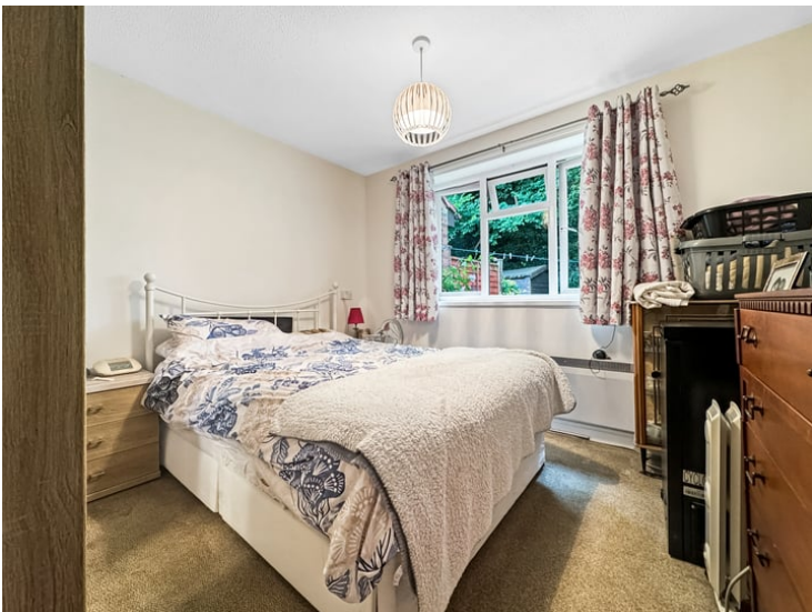
10' 4" x 10' 10" (3.15m x 3.30m)