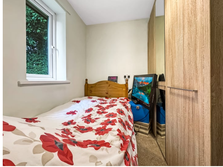
6' 7" x 9' 0" (2.01m x 2.74m)