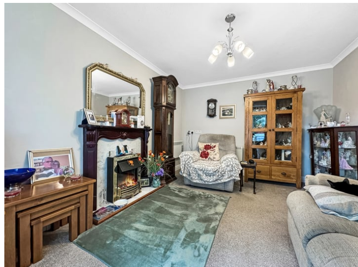
14' 5" x 10' 4" (4.39m x 3.15m)