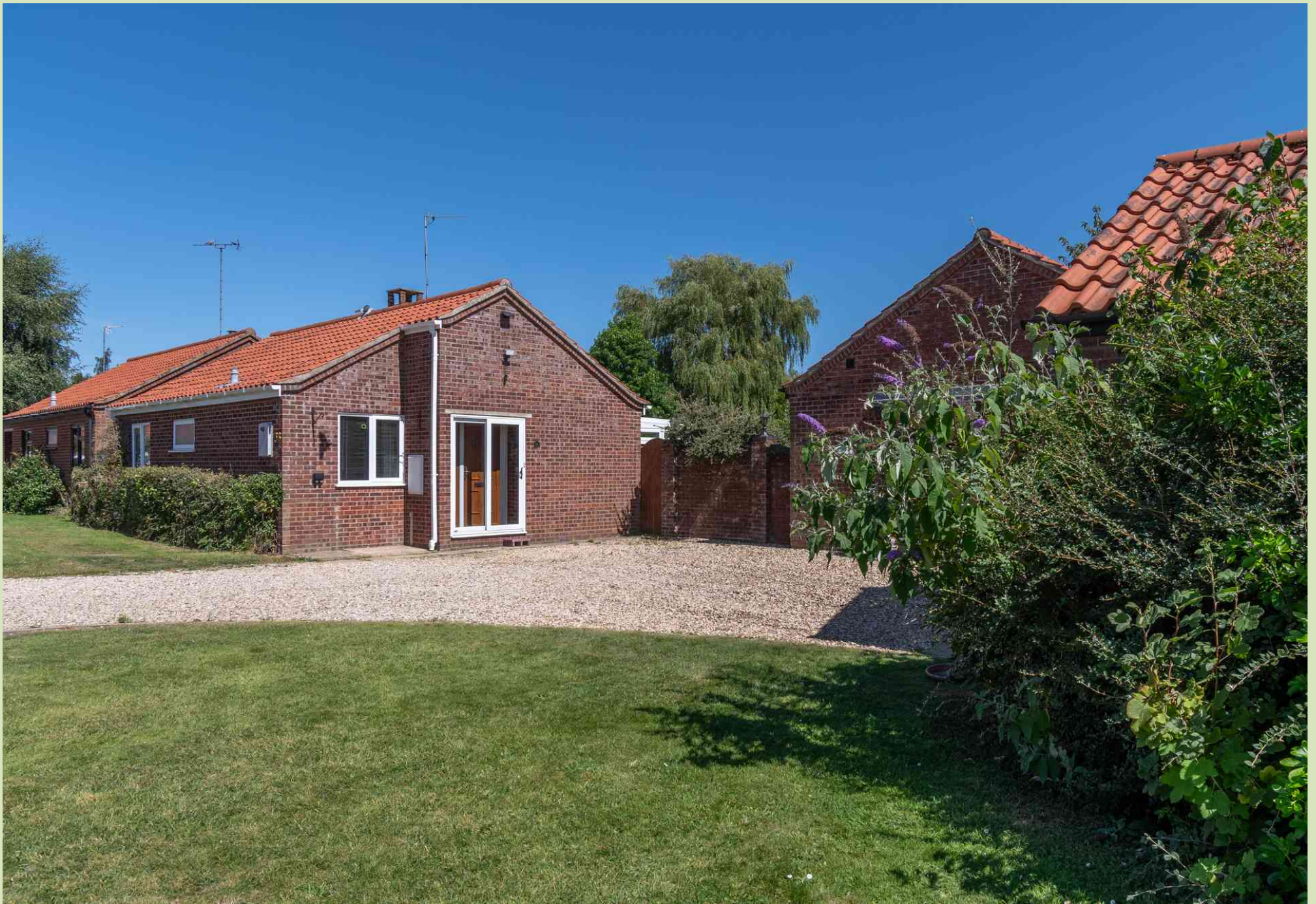
38 Walcups Lane, Great Massingham Guide Price £235,000