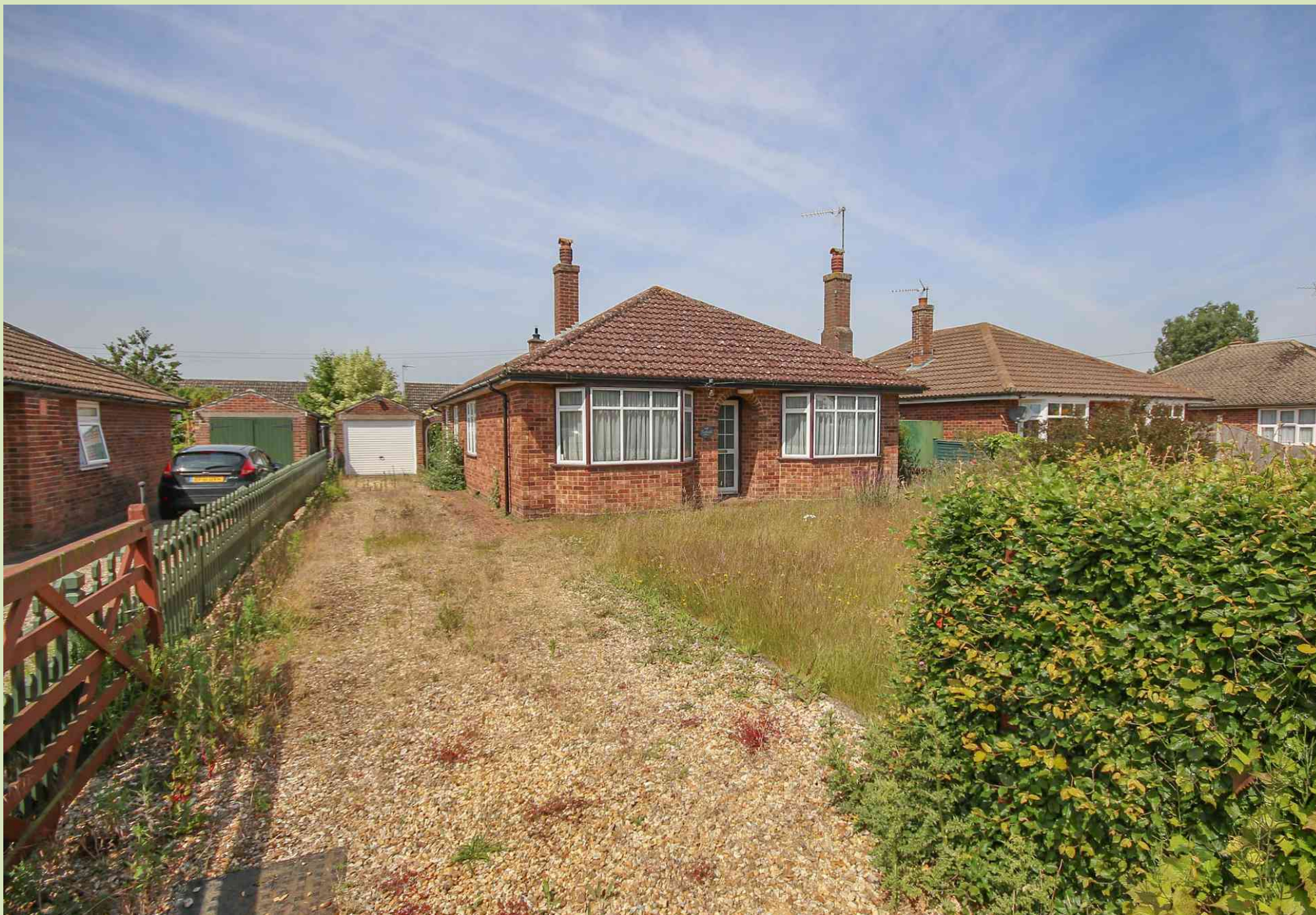
102 Downham Road, Watlington Guide Price £290,000