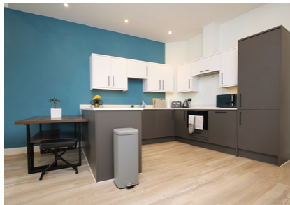
14 The Cross, 101-107 Commercial Road, Lower Parkstone, Poole, Dorset BH14 0DL