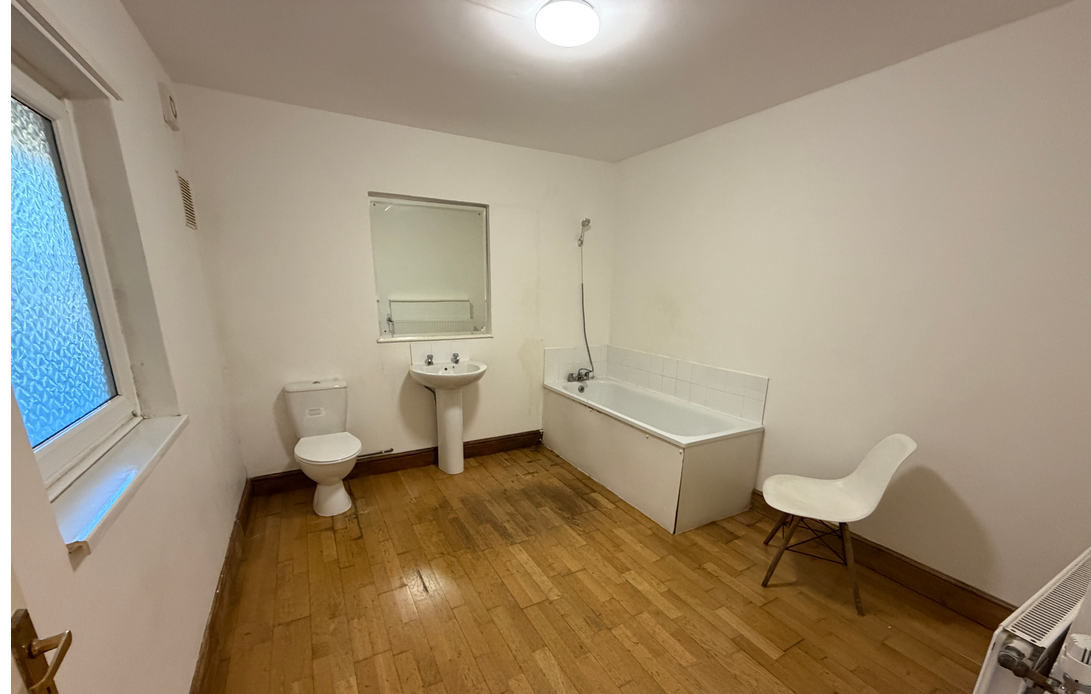
112 Clare Road, Stanwell, Surrey TW19 7EH £599,950 - Freehold