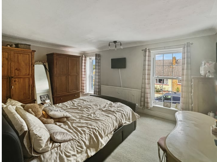
15' 5" x 11' 06" (4.70m x 3.51m) Double glazed windows to front, radiator.