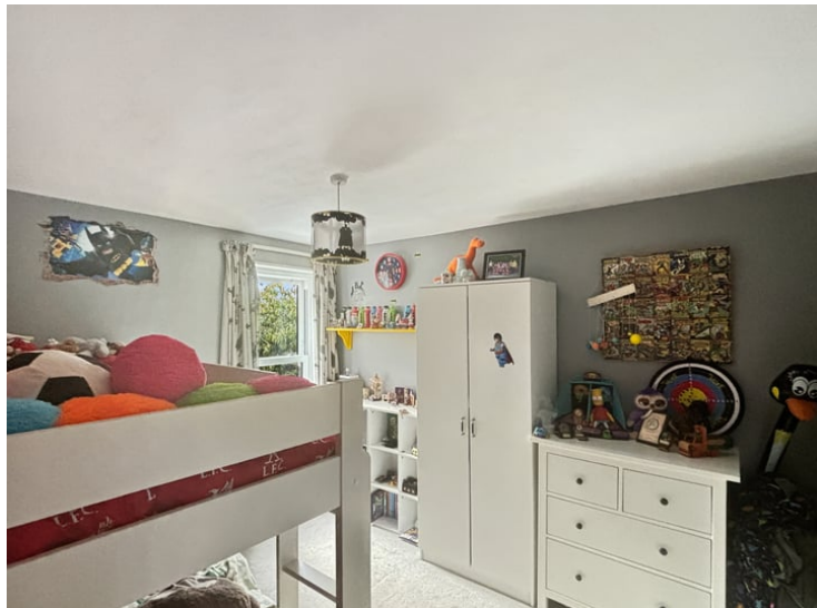
10' 9" x 9' 01" (3.28m x 2.77m) Double glazed window to rear, radiator, airing cupboard.