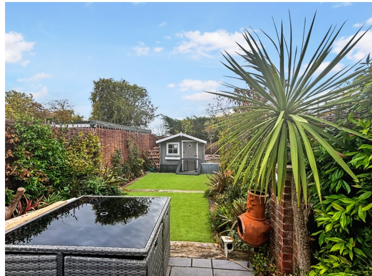
A well maintained south/west facing rear garden including patio area, artificial grass, summer house, double side access.