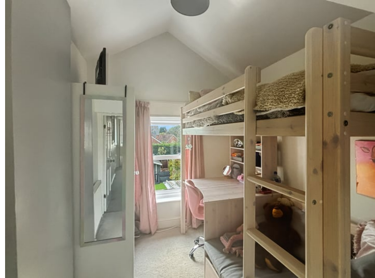
9' 0" x 7' 3" (2.74m x 2.21m) Double glazed sash window to rear, radiator.