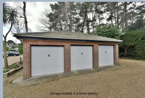
Garage located in a block nearby