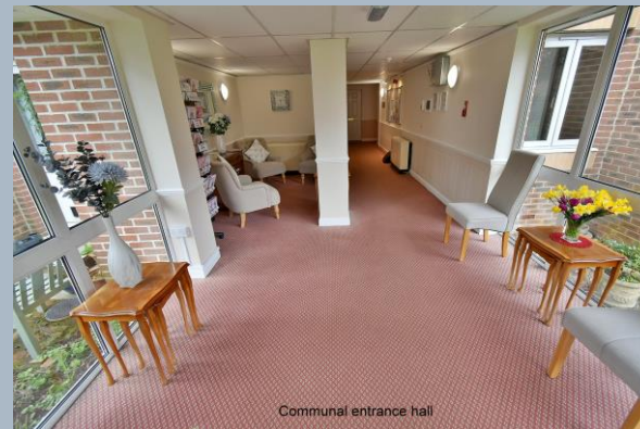
Communal entrance hall