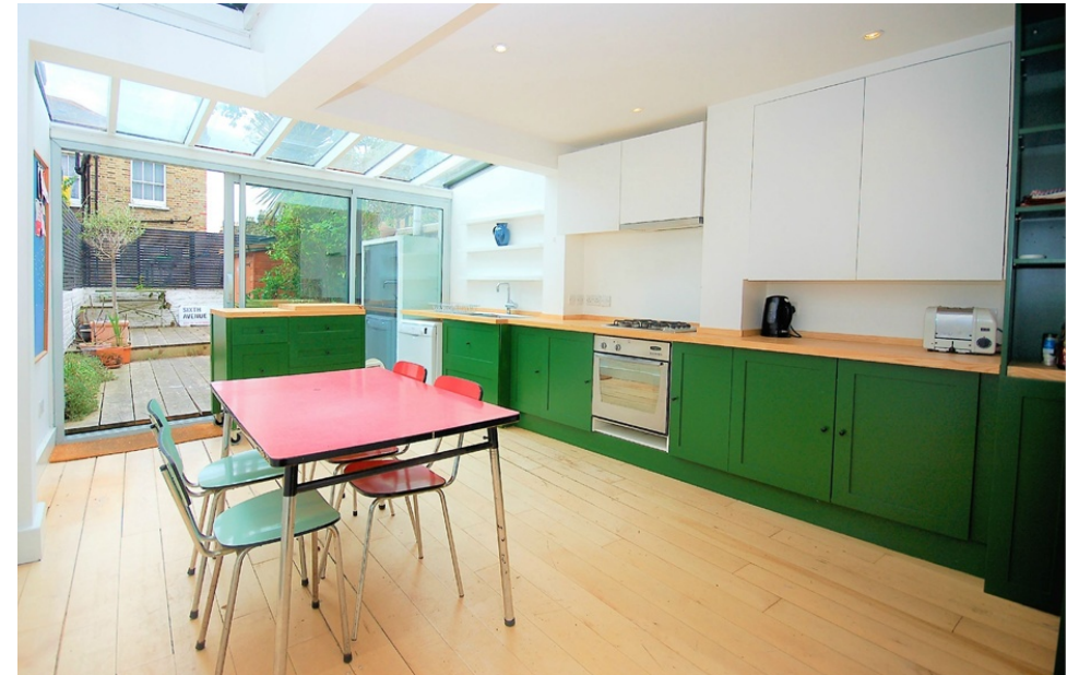
Kilburn Lane, Queens Park, LONDON W10 4AS £850,000 - Freehold