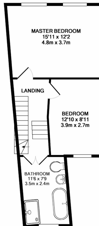
1ST FLOOR APPROX. FLOOR AREA 462 SQ.FT. (42.9 SQ.M.)

TOTAL APPROX. FLOOR AREA 1070 SQ.FT. (99.4 SQ.M.)