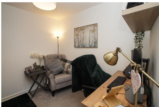
RECEPTION ROOM 2/OFFICE

RECEPTION ROOM 2/OFFICE (8'7 x 7'9) This room has been created from part of the garage and has power and lighting.