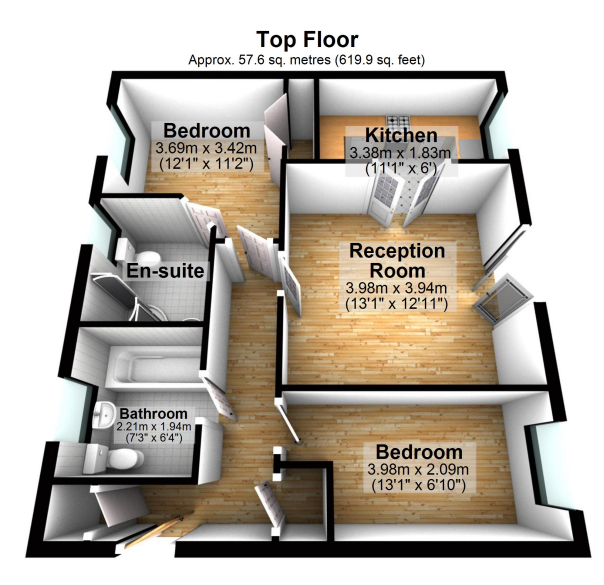
Total area: approx. 57.6 sq. metres (619.9 sq. feet) Plan and measurements are for guidance only. Floor plan produced by Propertypics.co.uk www.propertypics.co.uk Plan produced using Planulp.

This has been a fantastic investment for me and it would either make a great first time home, or I've always found really good tenants.