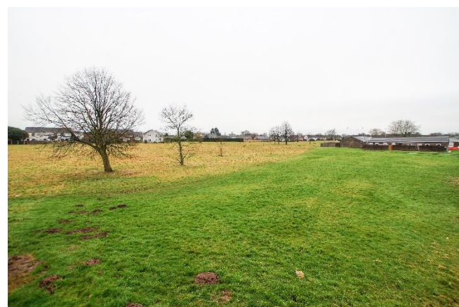
VIEW FROM REAR GARDEN