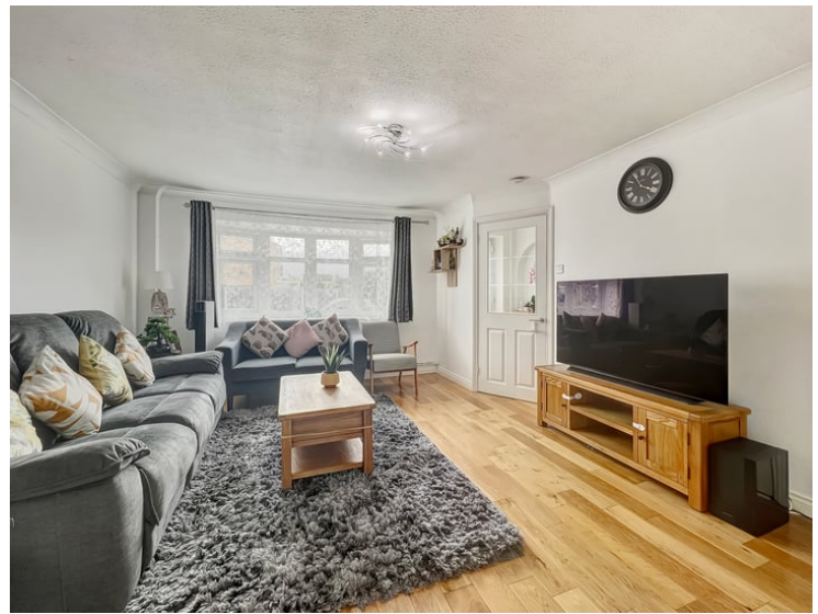
14' 4" x 13' 10" (4.37m x 4.22m)