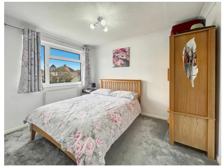
10' 8" x 10' 0" (3.25m x 3.05m)