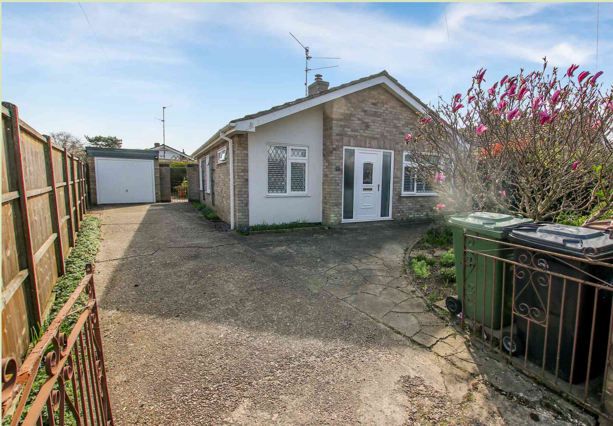
7 Greenacre Close, South Wootton Guide Price £290,000