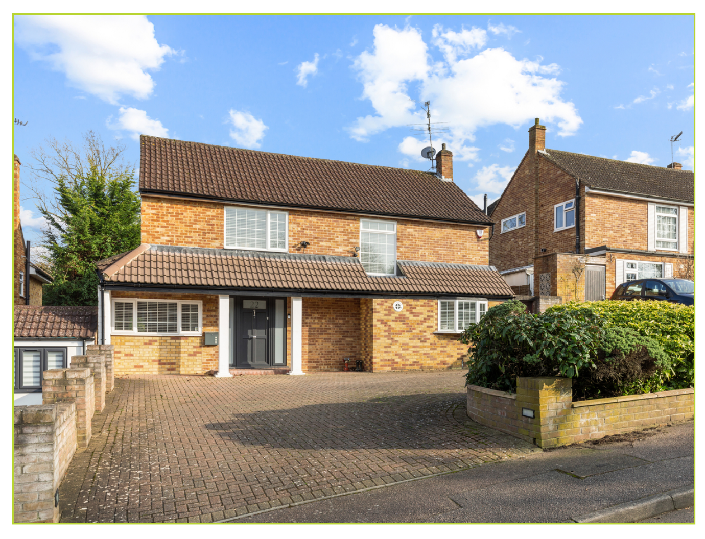
Little Potters, Bushey Heath, Hertfordshire. WD23 4QT. £1,250,000 Freehold

Situated in a highly regarded road in the heart of Bushey is this contemporary 4 bedroom, detached property. Offered for sale in good condition throughout, this light and spacious property comprises of a large living room, fitted kitchen diner, second reception room, study and ground floor cloakroom. On the first floor there are 4 double bedrooms, family bathroom and ensuite to the master bedroom. The property has a carriage driveway with parking for several cars and a large secluded rear garden. There is potential to extend the house further, subject to all usual consents.