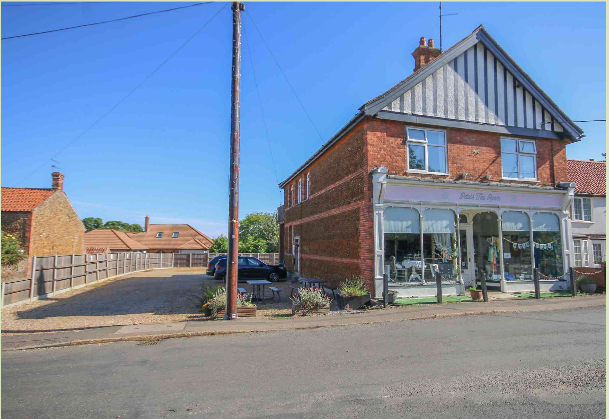
61 Manor Road, Dersingham Guide Price £400,000