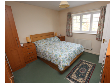
18 Tithe Farm Close, Langford, Bedfordshire, SG18 9NE