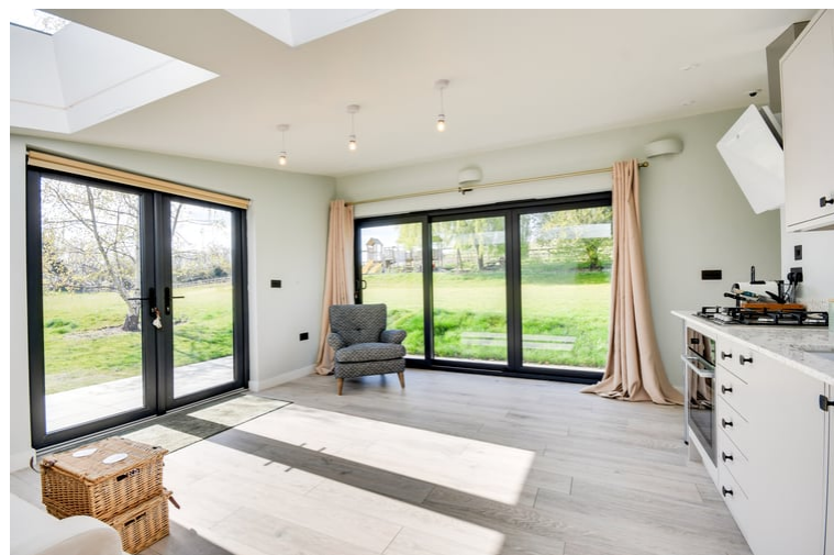
Annex Living & Kitchen Area